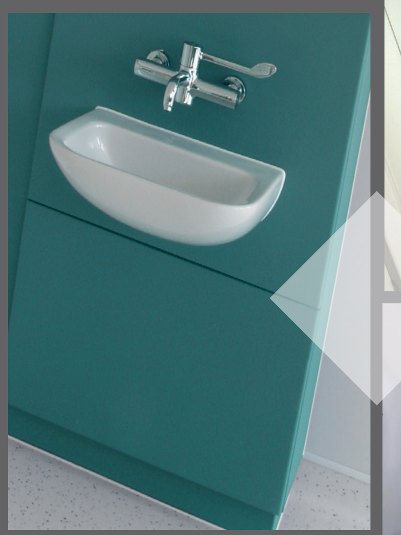
A unique opportunity to augment a scheme with co-ordinated panels that offer the same longevity and benefits as high performance Hydroclean wall cladding.

SDS provides a fully integrated design approach using the potential of dFend or Hydroclean to encapsulate IPS units, panels and boards.