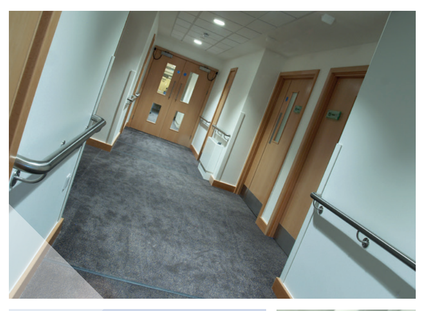
SDS supplies a comprehensive range of stainless steel corner guards and crashrails. These products are inherently tough yet fully compatible with food preparation areas. SDS also has an extensive portfolio of rubber profiles for extreme environments. These are well suited to back-of-house locations and can resist extremes of

temperature and collisions from motorised