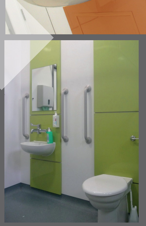
For full details on Hydroclean and our IPS Panels visit: www.sdsprotection.co.uk