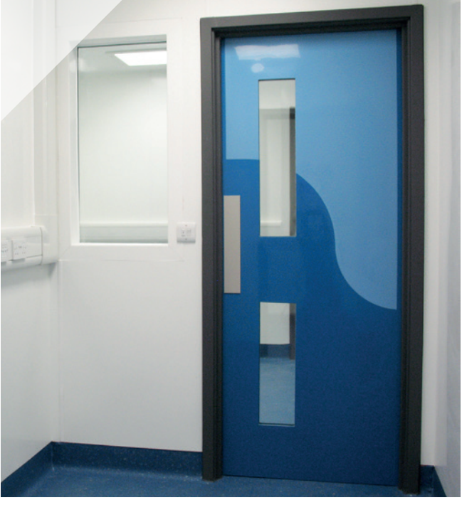
Doorsets encapsulated with smooth Hydroclean