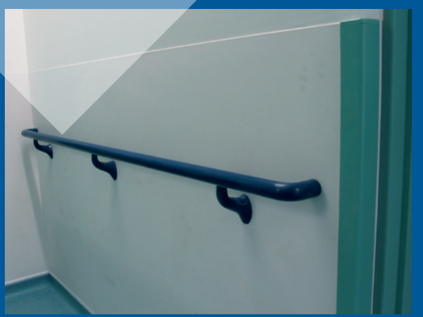
For full details on SDS dFend sheet visit: www.sdsprotection.co.uk